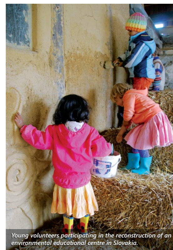
Young volunteers participating in the reconstruction of an environmental educational centre in Slovakia.