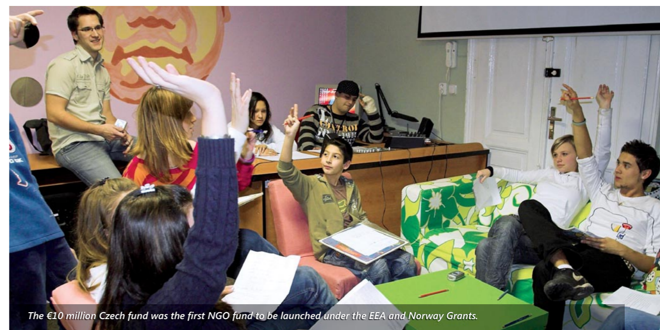
The €10 million Czech fund was the first NGO fund to be launched under the EEA and Norway Grants.

The open calls have so far been met with great interest from NGOs. In the immediate aftermath of the cold war, Central and Eastern European countries saw a surge in support from foreign donors. However, after becoming members of the EU, many of the donors have pulled out to pursue projects further to the east and south. The support from the EEA and Norway Grants has therefore become even more important in order to prevent a young and fledgling civil society from being hampered by a lack of funds, and contribute to its continuous development.