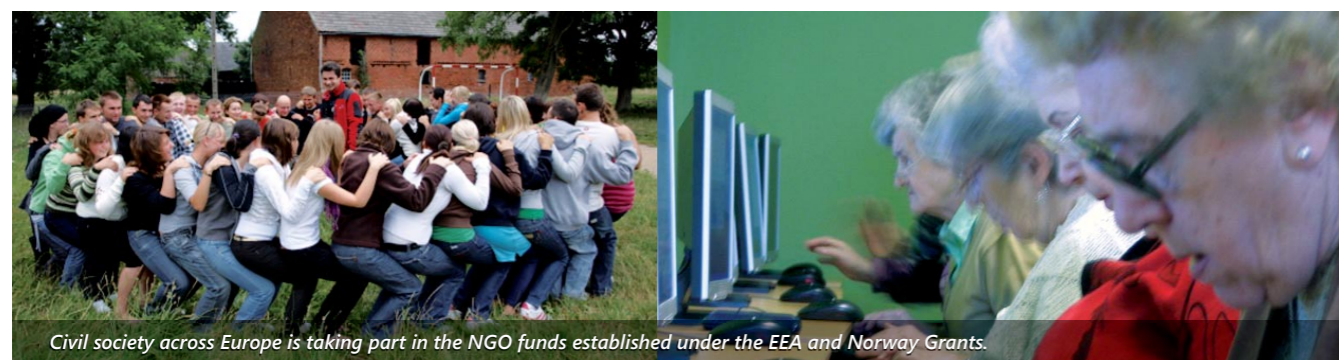
Civil society across Europe is taking part in the NGO funds established under the EEA and Norway Grants.

By sharing experiences and creating strong partnerships between NGOs, enterprises and universities, the project "Efficient NGOs, viable society", aims to strengthen Estonian NGOs' capacity. Through impact and capacity assessment, stimulating legitimate partnerships and offering continuous support to the partners, some 20 organisations are set to benefit from the support.