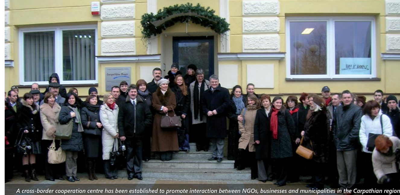
A cross-border cooperation centre has been established to promote interaction between NGOs, businesses and municipalities in the Carpathian region.

The fund provides small grants to bilateral projects between institutions at the local and regional level. The aim is to facilitate the transfer of Norwegian know-how and good practices to Lithuania, as well as to encourage exchange of experience between institutions in the two countries. Grants are awarded to projects that contribute to developing regional policy in Lithuania and strengthen cooperation between counterparts in Lithuania and Norway.