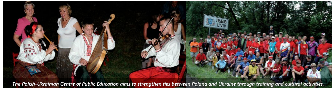
The Polish-Ukrainian Centre of Public Education aims to strengthen ties between Poland and Ukraine through training and cultural activities.

A Polish-Ukrainian Centre of Public Education in Kraśnik, Poland shall facilitate the introduction of local partnership models in Poland and Ukraine, as well as provide distance-learning based training of public administration and civil society organisations. The intention is to develop cross-border cooperation and to improve local and regional administration in the two countries.