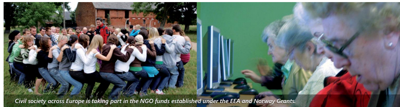
Civil society across Europe is taking part in the NGO funds established under the EEA and Norway Grants.

By sharing experiences and creating strong partnerships between NGOs, enterprises and universities, the project "Efficient NGOs, viable society", aims to strengthen Estonian NGOs' capacity. Through impact and capacity assessment, stimulating legitimate partnerships and offering continuous support to the partners, some 20 organisations are set to benefit from the support.