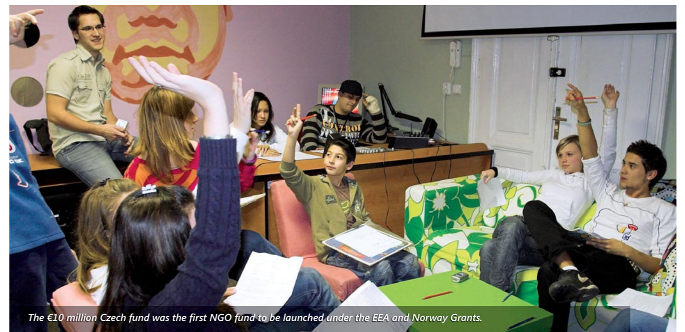
The €10 million Czech fund was the first NGO fund to be launched under the EEA and Norway Grants.

The open calls have so far been met with great interest from NGOs. In the immediate aftermath of the cold war, Central and Eastern European countries saw a surge in the support from foreign donors. However, after becoming members of the EU, many of the donors have pulled out to pursue projects further to the east and south. The support from the EEA and Norway Grants has therefore become even more important in order to prevent a young and fledgling civil society from being crippled by a lack of funds, and contribute to its continuous development.