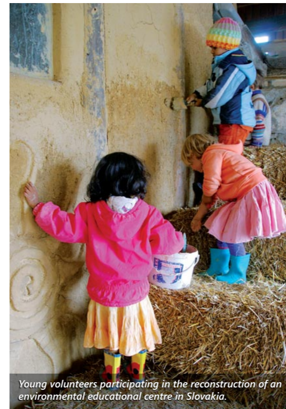
Young volunteers participating in the reconstruction of an environmental educational centre in Slovakia.