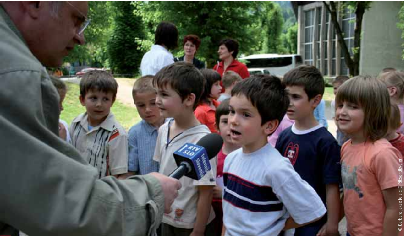
Renovated historical buildings in the old town centres of five cities in the Gorenjska region have provided local inhabitants with new public and cultural venues.

There will also be another scholarship fund , plus new funding to promote decent work and social dialogue .